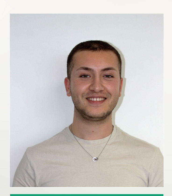
Find out more about the services we offer at dals.co.uk

By creating pathways to employment for individuals, contributing to the economic growth, and reducing unemployment rate.